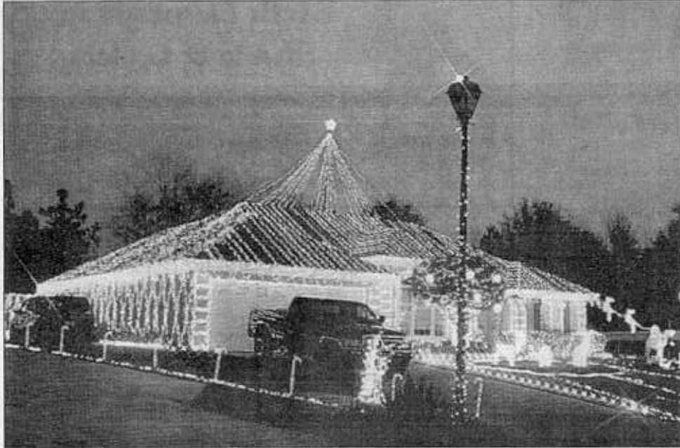
JULIE E. HEDGES Special to Northland Neighbors

The new portions of this year's display will consist of an animated Santa, sleigh and eight reindeer. This display will stretch over 30 feet long on the roof. This year all of the 60,000 lights will be controlled by a computerized program. The lights will dance to music transmitted through a FM station transmitting within site of the home, FM 90.1.